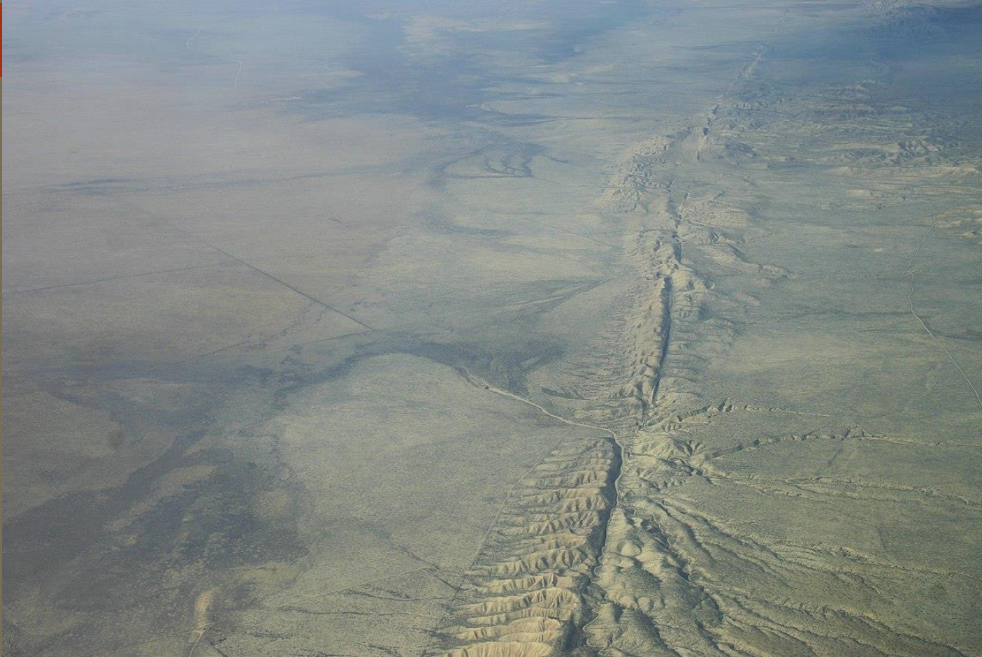
San Andreas Fault in the Carrizo Plain, northwest of Los Angeles

All over our world there are fault lines where plates of the earth's surface are colliding. The plates are always moving and pressing against one another. When there is a sudden lurch we call it an earthquake. When the molten core of earth intrudes up through these plates we have a volcano. When the earth shakes near the sea or under it causes a tide called tsunami. These are the images that the writers of Psalm 46 paint.