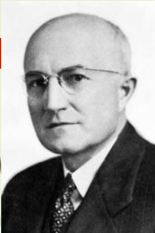
Kenneth Scott Latourette, 1884-1968. Missionary to China, author, Yale professor, leader in the American Baptist Organization

His books the History of Christianity vol. 1-2 is one of the most readable church histories. It is generally even handed.