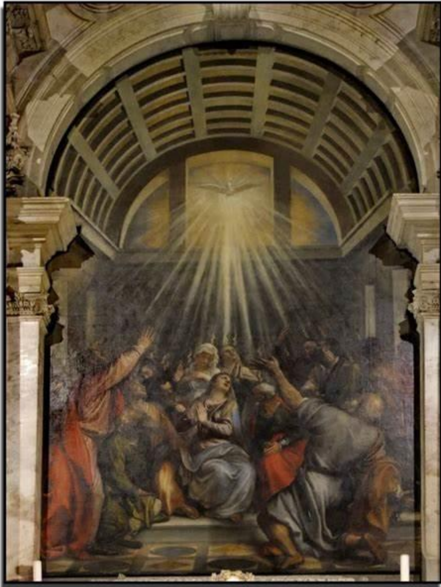
The day of Pentecost by Titian

We must be led by the Holy Spirit. As Pentecostal Christians we need to be especially led by the Holy Spirit.