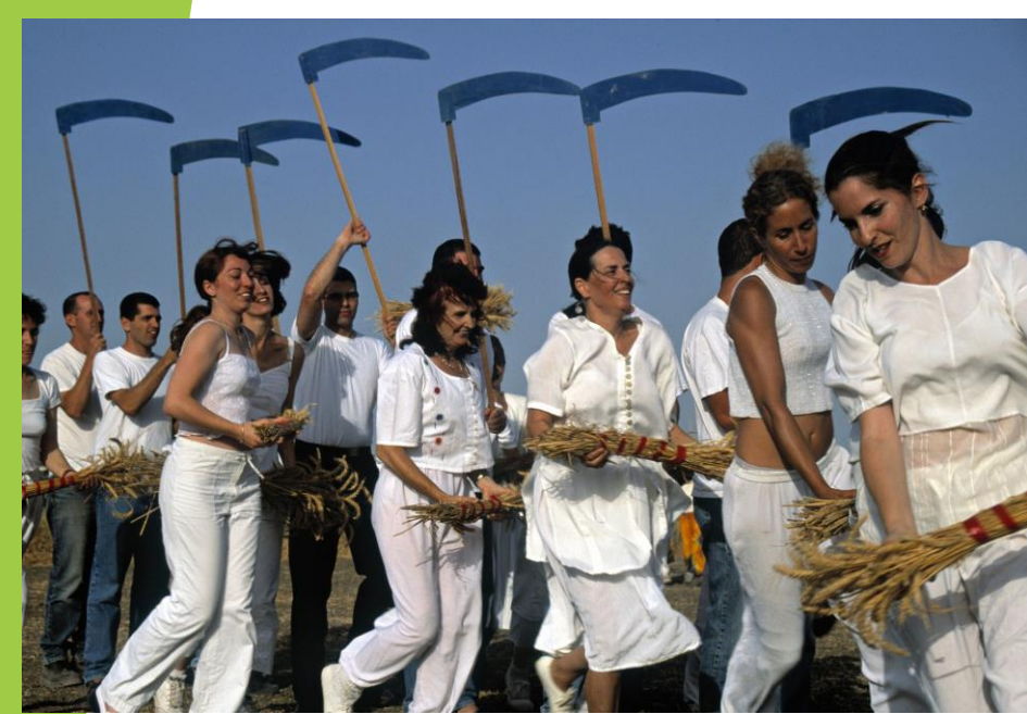
Celebration of Shavuot on a Kibbutz near Tel Aviv, Israel. Below, the presentation of the “first fruits of harvest”