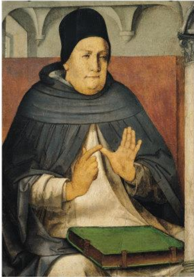
Thomas Aquinas [1225-1274]