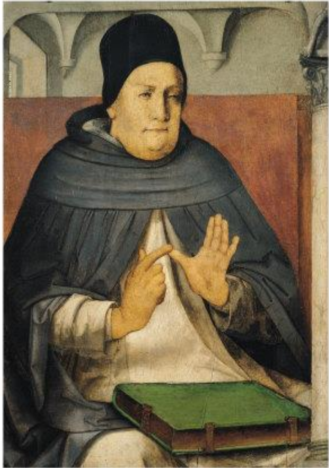
Thomas Aquinas [1225-1274]