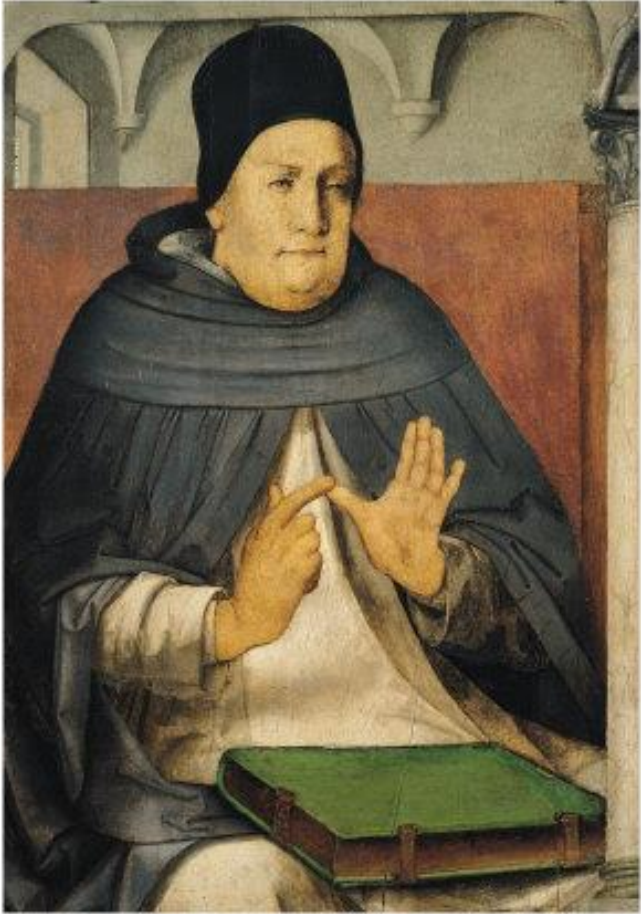
Thomas Aquinas [1225-1274]

Thomas Aquinas was one of the most influential thinkers in Western Civilization. His philosophy molded the modern world. His concepts of “Just War” still impact International Law today. Aquinas was a Christian scholar and monk.