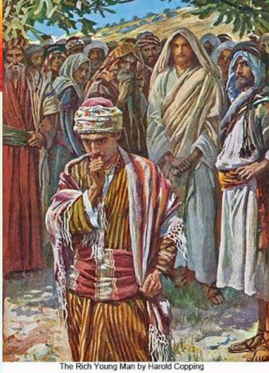
The Rich Young Man by Harold Copping