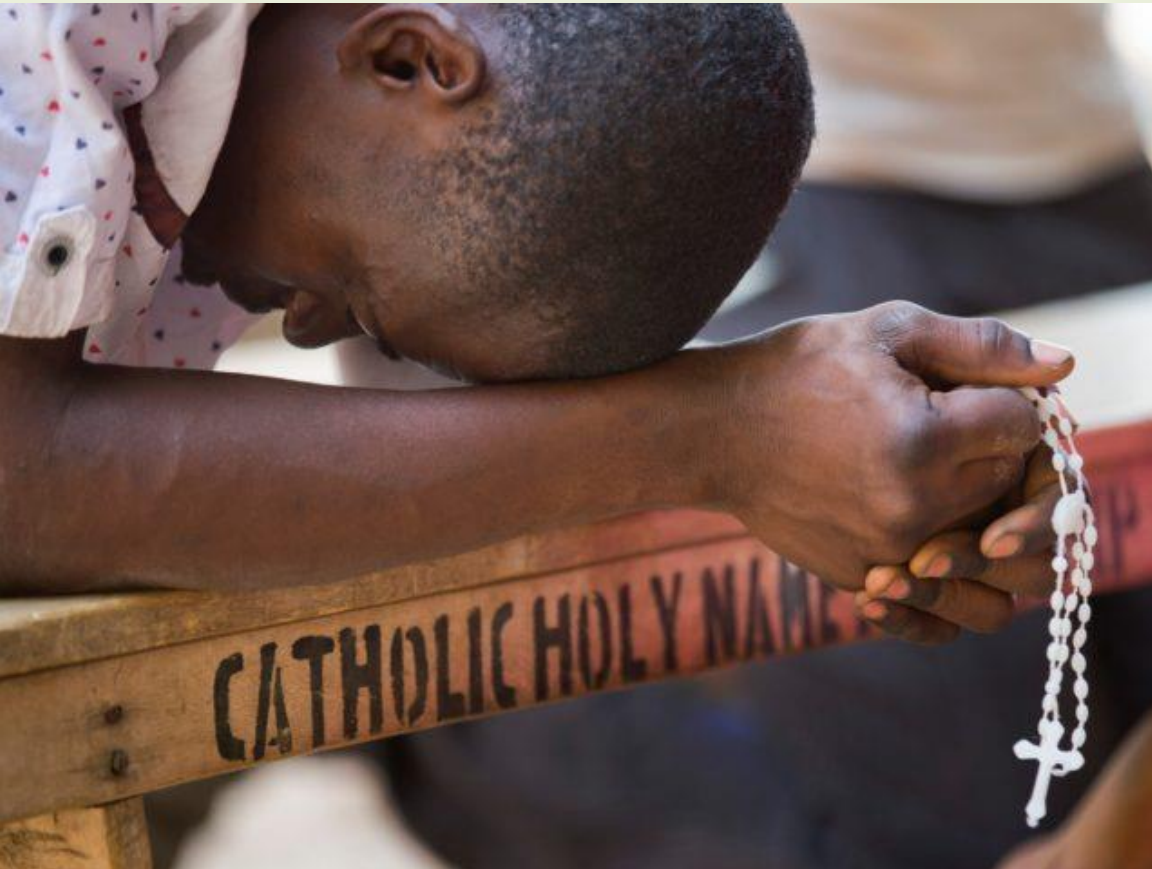
A Nigerian Christian at prayers .

Since 2009 over 36,000 of our Christian brothers and sisters have been murdered for their faith by Islamic Jihadists in the first 4 months of 2021, 1,470 have been martyred and 2200 have been kidnapped, far outpacing previous years. Nigeria has experienced the most sever persecution of Christians in the world. The rise of Christian persecution around the world has been dramatic in the last 10 years. Little is being done by Western governments to stem the tide of Christian genocide around the world. 1 Corinthians 12:23-26