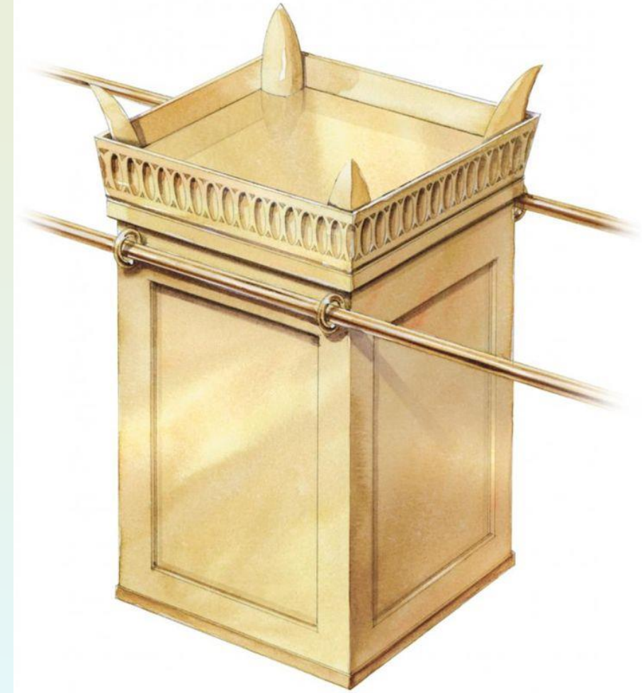
The altar of incense

The wooden altar, overlaid with pure gold (Ex. 30:1–10; 37:25–28), was 3 feet high, and 1.5 feet long and wide (1 m x 0.5 m x 0.5 m). It stood in the Holy Place before the veil which separated the Holy Place from the Most Holy Place. It was transported by means of wooden poles which were overlaid with gold and inserted through rings attached to the sides of the altar.