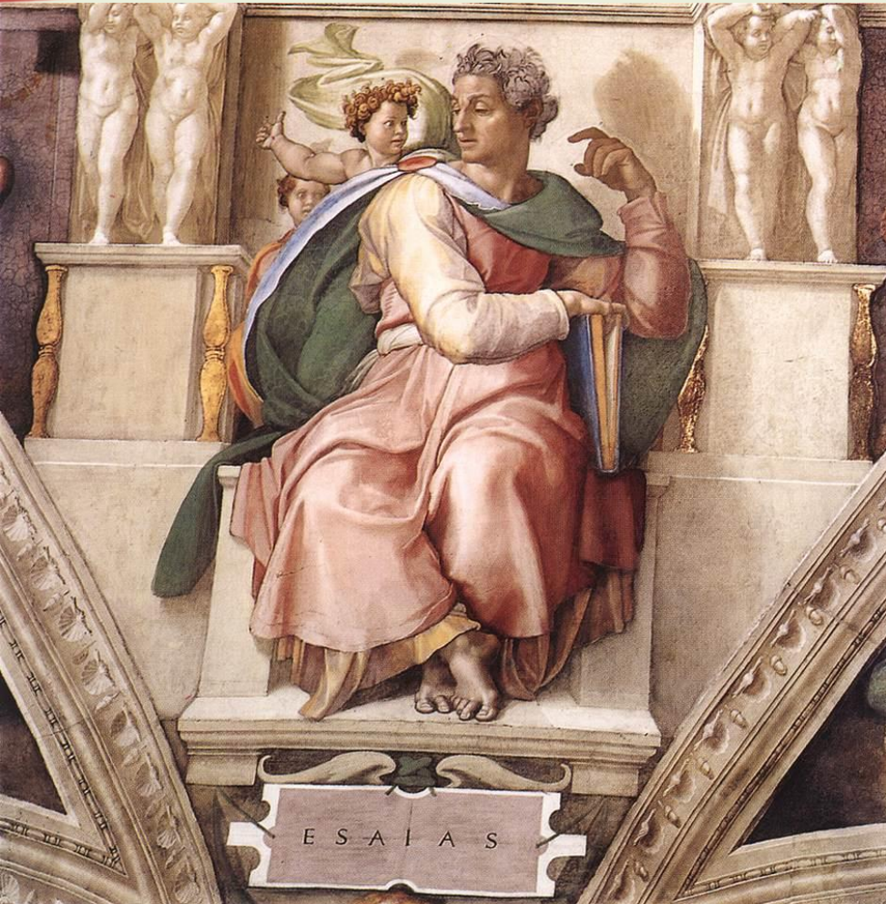
Isaiah by Michelangelo 1508-12

Series: The Glory of the LORD – Isaiah 6