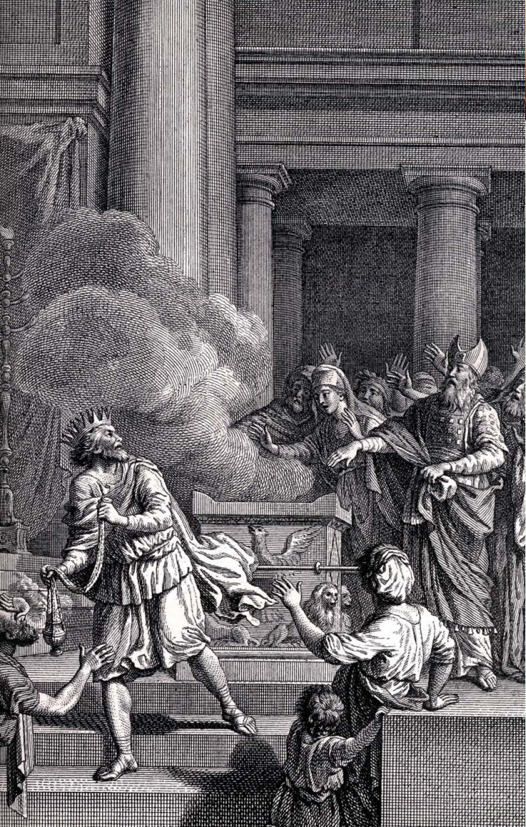
King Uzziah is withstood by the priests in the temple.