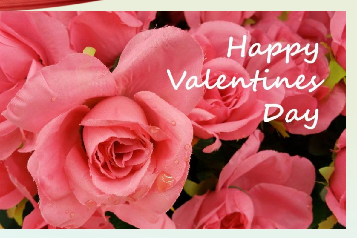
What is the perfect marriage?

In the generation prior to the "Baby Boom" generation long committed marriages were common. They often showed their ware and it was clear that both spouses had toughed through some rough patches. But they did not expect from their marriage "a magic carpet ride" of unending ecstasy, meaning, solicitude and equal outcomes.