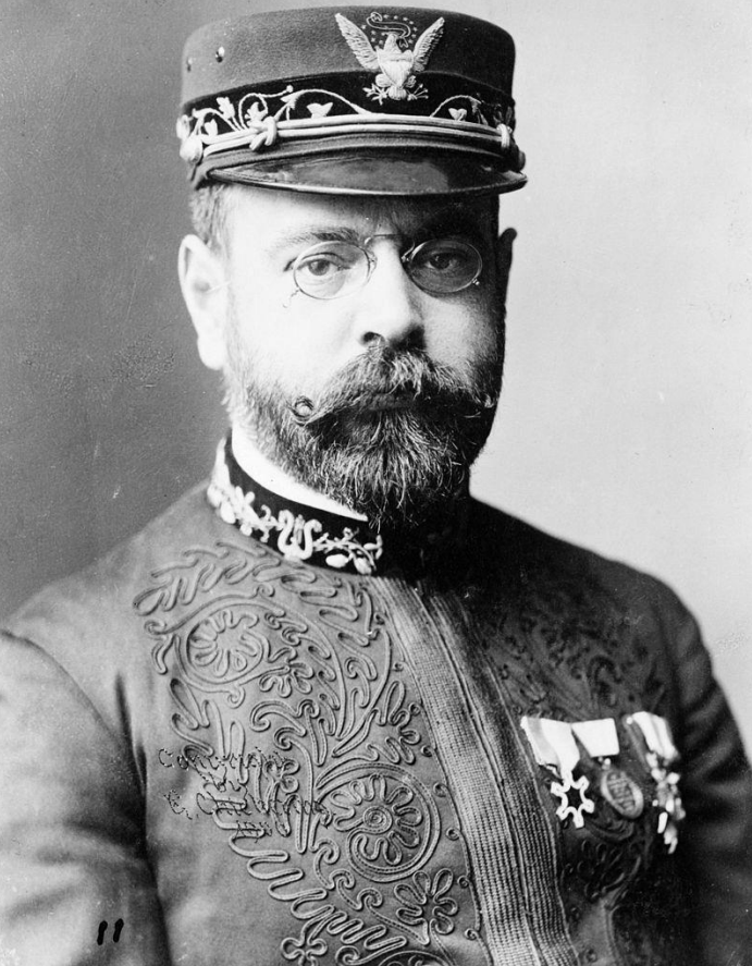
John Philip Sousa [1854-1932. One of the greatest band composers of 19 th & 20th century