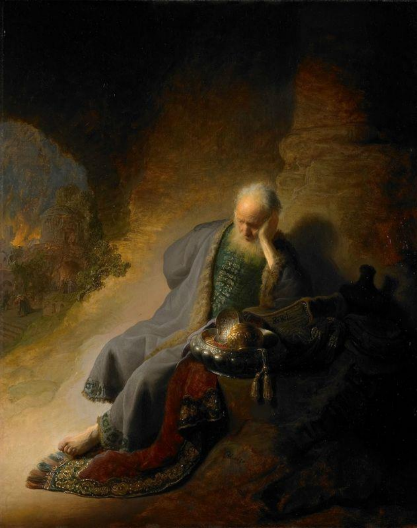
“Jeremiah Laments The Destruction of Jerusalem” – Rembrandt.