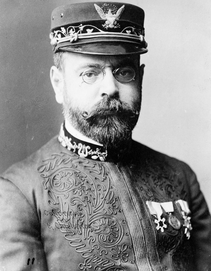
John Philip Sousa [1854-1932. One of the greatest band composers of 19 th & 20 th century