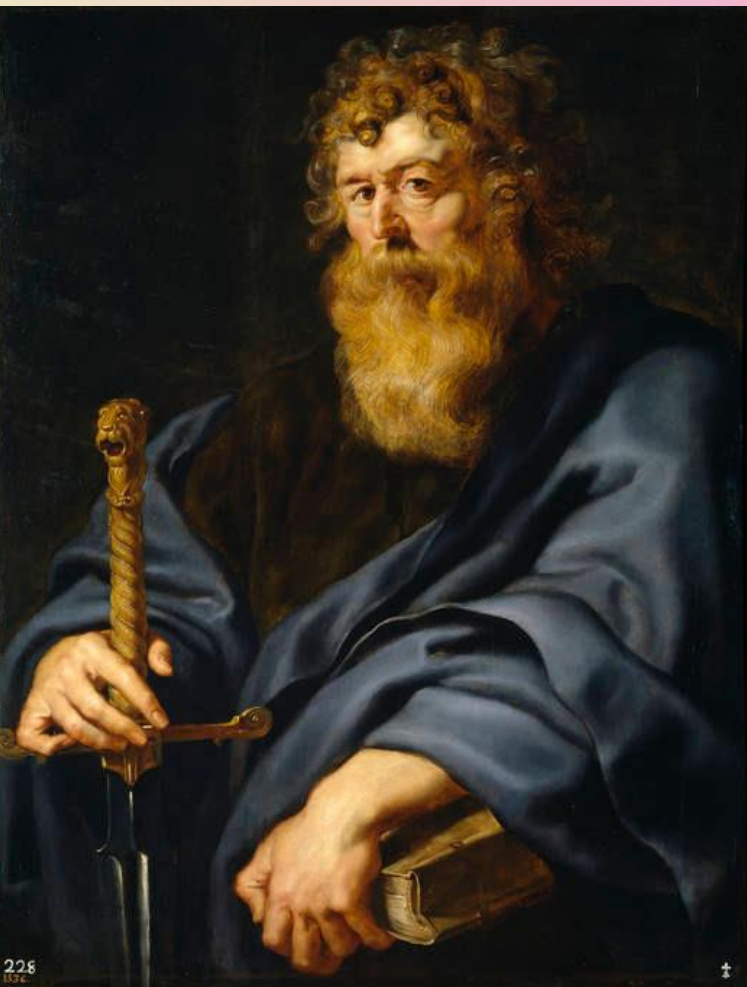
Apostle Paul by Peter Paul Rubens 1577-1640

In addition, an apostle must have a direct commission from Jesus Christ. This is why Paul tells the Corinthians [1 Corinthians 15:8] he was an apostle “born out of due season”, because he was not present when Jesus had directly commissioned his other apostles. Paul appeals for his apostolic authority to the direct commission from Jesus on the road to Damascus and the “signs of an apostle”. He indicates special powers given to the apostles when Jesus sent them out. The Church leaders examined apostles’ credentials based on these criterion. [Revelation 2:2]