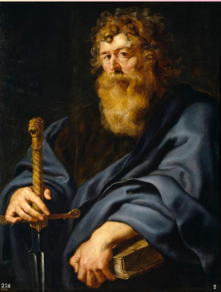
Apostle Paul by Peter Paul Rubens 1577-1640

Paul in many ways seems to have had a similar personality and upbringing to Judas. According to tradition Judas came from a well to do Pharisee family. He was likely skilled at business and probably felt himself superior to most of the other disciples.