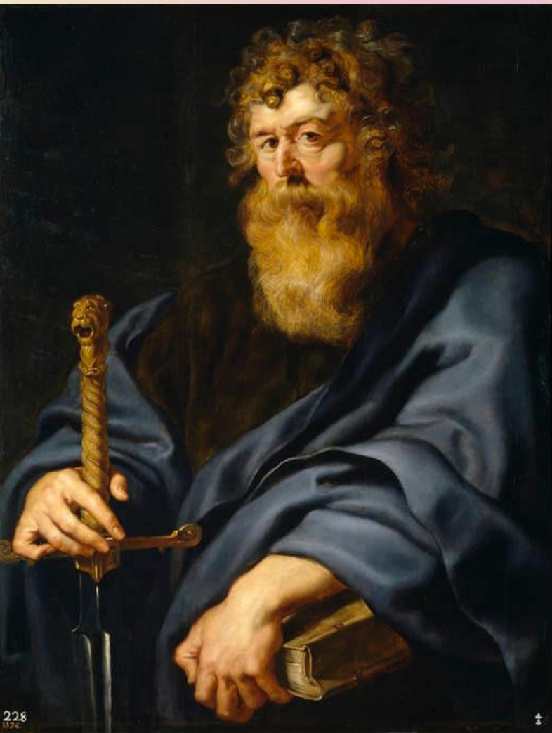
Apostle Paul by Peter Paul Rubens 1577-1640